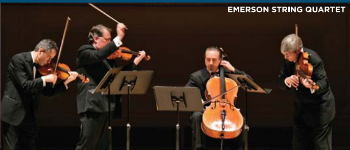
EMERSON STRING QUARTET